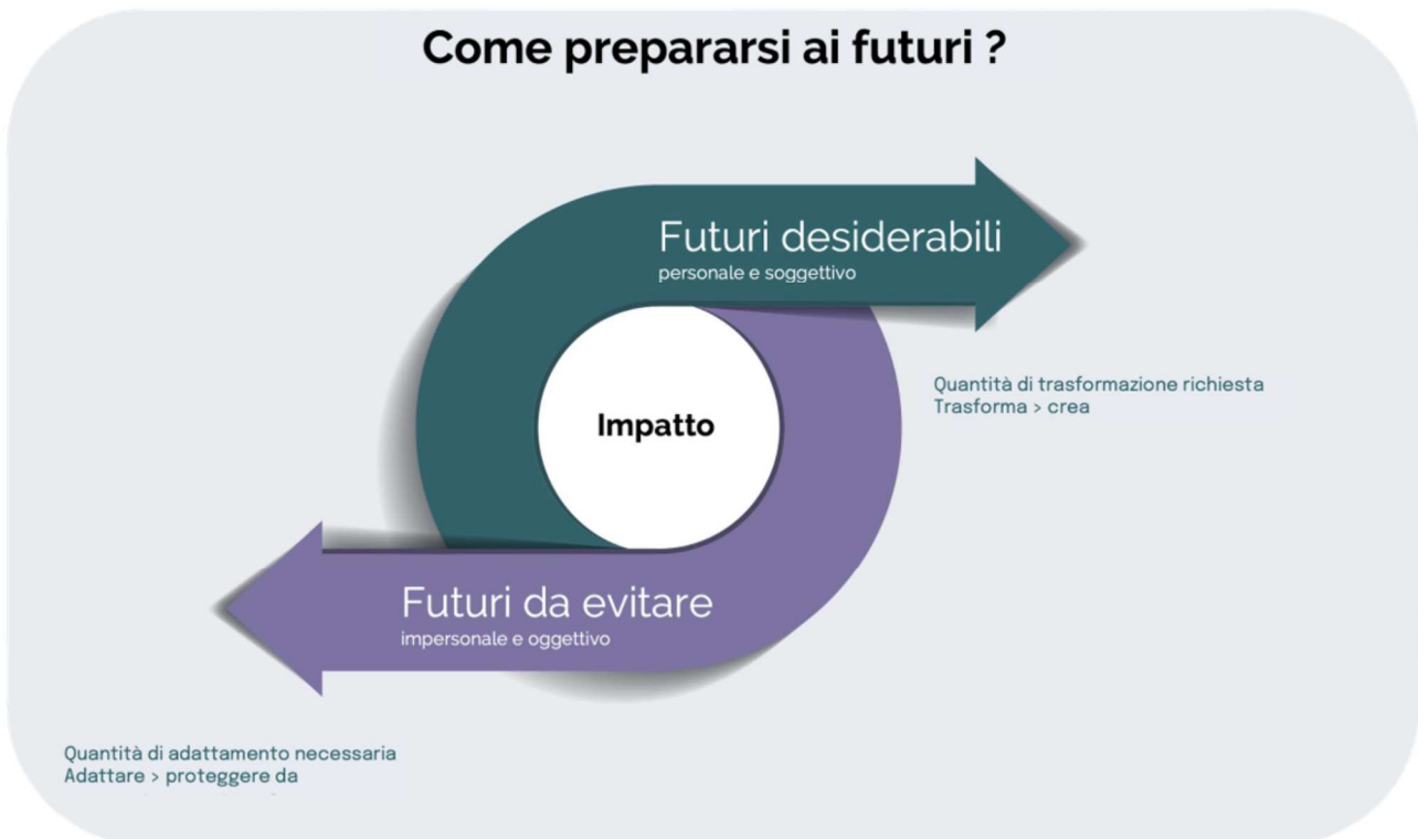
A schematic representation of the thinking model that guides foresight device projects and enables better preparation for possible futures in a context of uncertainty (Ladetto, 2022).

Such futures are not considered in relation to time horizons, but in relation to the differences and impacts they present in relation to the present (single), or in relation to presents (a multitude) if we take into consideration our different mental models.